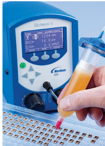
Dispensing flux onto electronic components.

Featuring simultaneous digital display of all dispenser settings and time adjustment as fine as 0.0001 seconds, Ultimus™ I-II dispensers bring exceptional process control to medical device, electronics, and other critical dispensing processes.