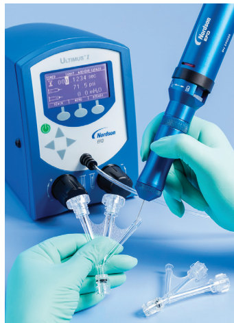
Dispensing adhesive onto medical components with HPX™ tool.

Ultimus dispensers bring exceptional process control to medical device, electronics, and other critical dispensing processes.