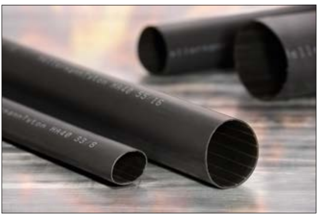
HA40 thick wall, adhesive lined and flame retarded tubing for shipbuilding