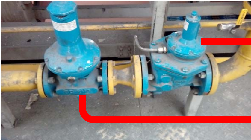
VALVULA SEGURIDAD ZONA N°2 SECADOR LINEA N°2

Marca: BRYAN DONKIN RMG GAS CONTROLS LTD. Type: 80 MM FIG.305 MP Serial: L37496 Max.inlet Pressure: 16 BAR Spring: 1059 Orifice: 76 MM Cut off Pressure: 1960 - 2750