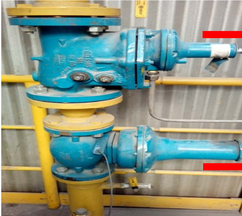
VALVULA SEGURIDAD ZONA N°1 SECADOR LINEA N°2

Marca: BRYAN DONKIN RMG GAS CONTROLS LTD. Type: 80 MM FIG.305 MP Serial: L37496 Max.intel Pressure: 16 BAR Spring: 1059 Cut off Pressure: 1960 - 2750 Orifice: 76 mm